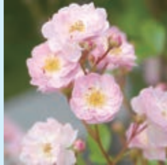
Rosa multiflora var. adenochela

This is a wild species of rose native to Japan that grows in sandy areas, such as coastal areas.