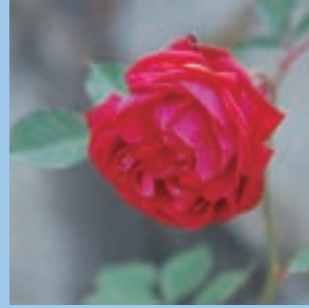
Semperflorens Ch This rose is believed to have been a source of genes for seasonal blooms and red flowers in modern roses.