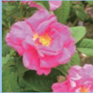
Rosa gallica 'Officinalis' G This rose is believed to have been cultivated since ancient times.