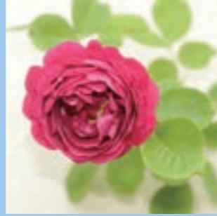
Général Jacqueminot HP This rose introduced the red color found in modern roses.