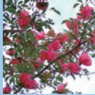
Rosa chinensis spontanea Sp This wild species is believed to be an ancestor of the Koshin rose (Chinese rose). After being known only from literature, it was rediscovered by a Japanese plant hunter in 1983.