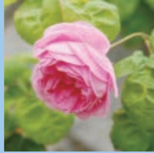
Bullata C Similar to centifolia, this rose is characterized by wrinkled leaves.