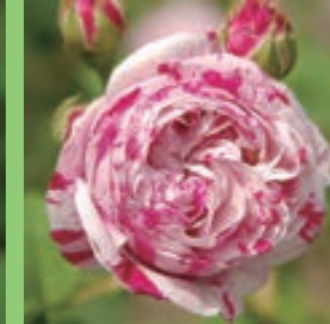
Variegata di Bologna

This rose was named after painter Henri Fantin-Latour, who was active in France.