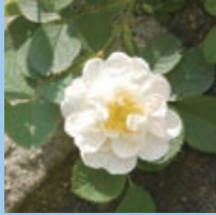
Alba Semi-plena A This rose is believed to be the rose depicted in the painting "The Birth of Venus" by Sandro Botticelli.

Our collection traces the development of rose breeding, from wild roses to modern roses.