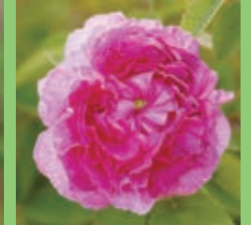
Belle de Crecy

This beautiful rose features dark pink stripes on a white background.