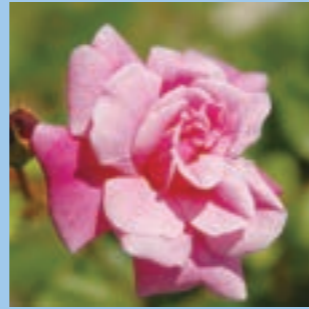
Old Blush Ch This species is considered the ancestor of roses that bloom in all four seasons.