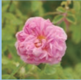
Autumn Damask D This rose has been used in perfumes since BC. It is noted for its ability to bloom more than once, including in autumn.