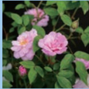
Rosa chinensis 'Minima' Ch This rose is believed to be the ancestor of modern miniature roses.