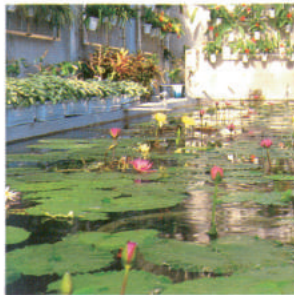
Tropical Water Lily Displayhouse