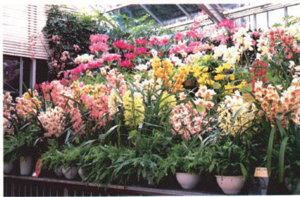
Exhibition of Orchids

About 50 exhibitions are held at three exhibition corners annually, and also, lectures and classes are held seasonally.