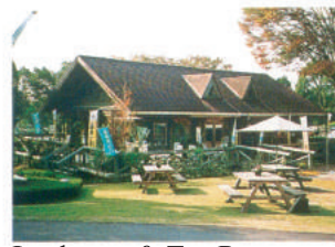
Loghouse & Tea Room